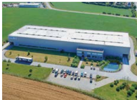
Plant at Treuen (D)