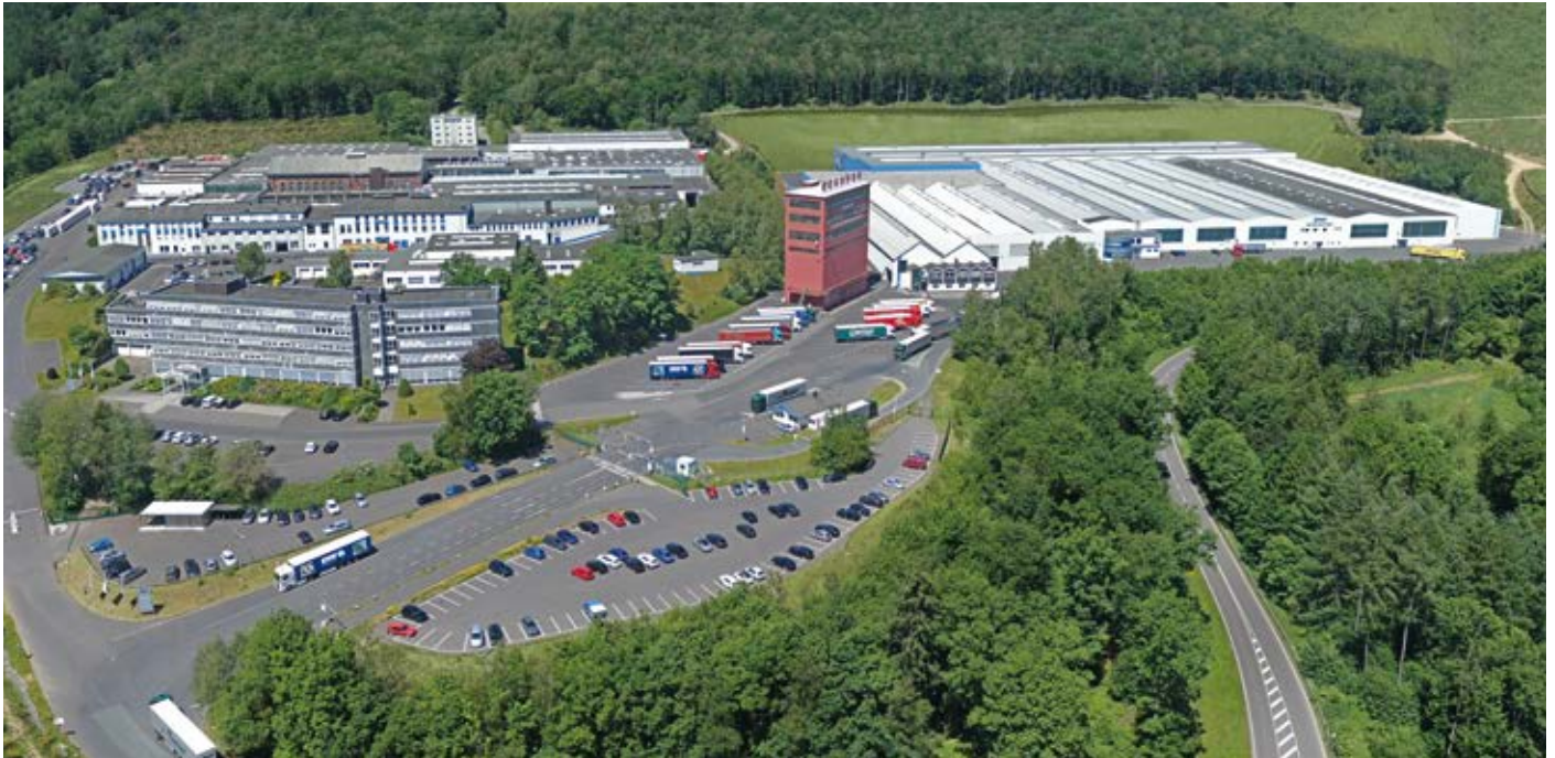
Head office and production site at Neunkirchen (D)