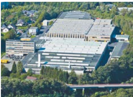
Plant at Betzdorf (D)