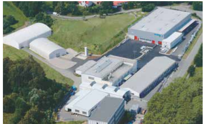
Plant at Ledec nad Sázavou (CZ)

SCHÄFER IT-Systems, an innovative manufacturer of made-to-measure network and server cabinet and data centre solutions for both conventional and complex applications, is part of the internationally successful company SCHÄFER WERKE. The owner-led group of companies has its headquarters in Neunkirchen in Germany's Siegerland region. The work of all the SCHÄFER WERKE divisions – SCHÄFER IT-Systems, SCHÄFER Industrial Solutions, SCHÄFER Interior Systems, SCHÄFER Container Systems, SCHÄFER Expanded Metal, SCHÄFER Perforated Metal and EMW Steel Service Centre – is based on high-quality fine steel sheet. The processing of this material is one of the core competencies of this enterprise.