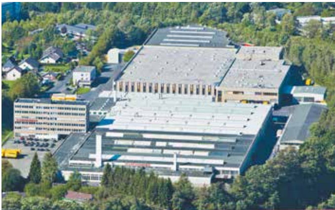
Plant at Betzdorf (D)