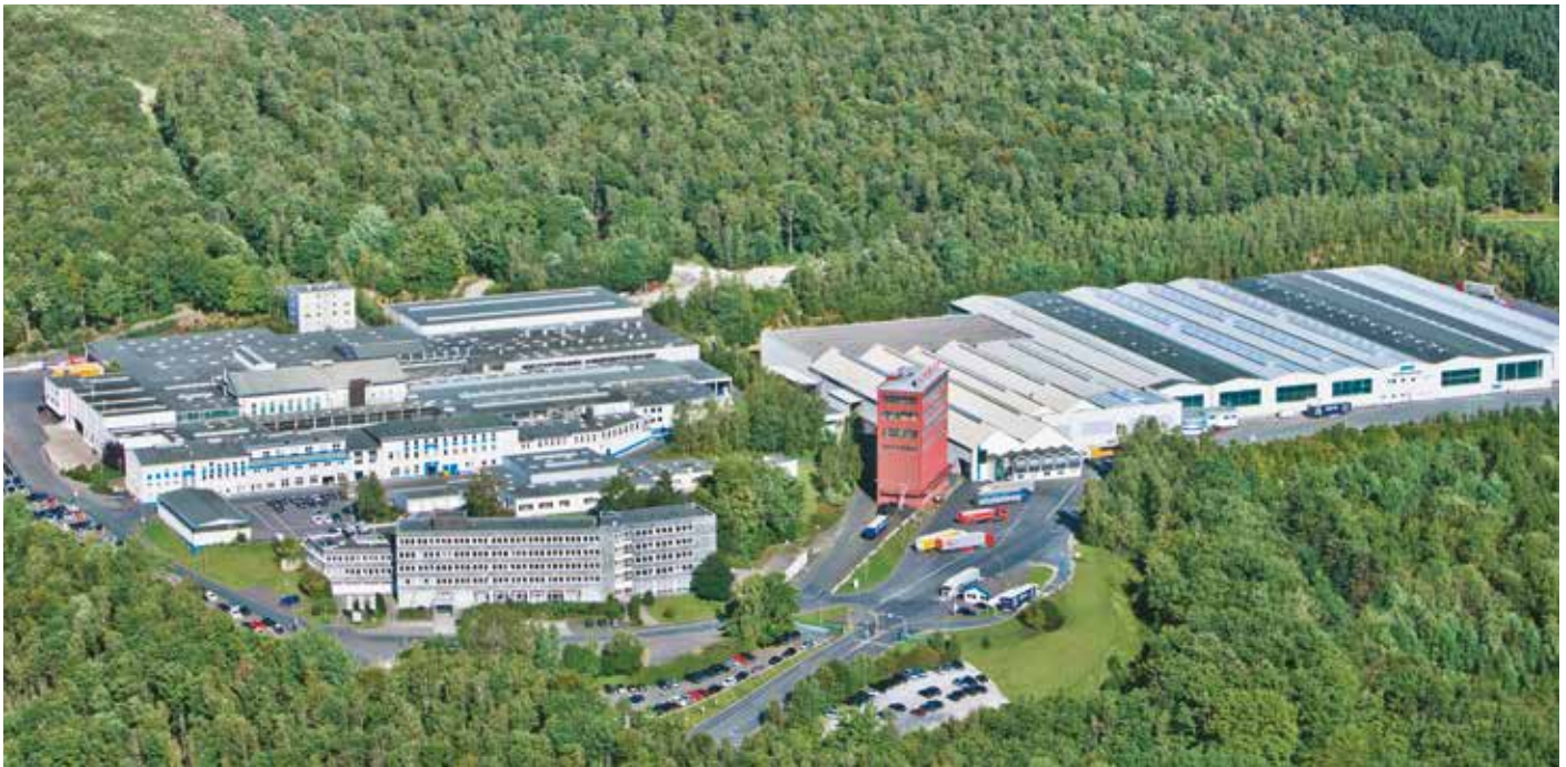
Head office and production site at Neunkirchen (D)