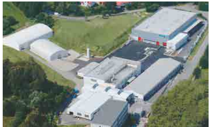
Plant at Ledec nad Sázavou (CZ)

SCHÄFER IT-Systems, an innovative manufacturer of made-to-measure network and server cabinet and data centre solutions for both conventional and complex applications, is part of the internationally successful company SCHÄFER WERKE.