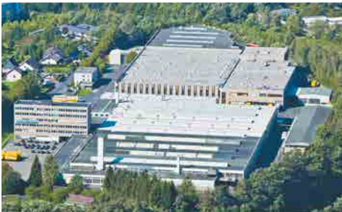
Plant at Betzdorf (D)