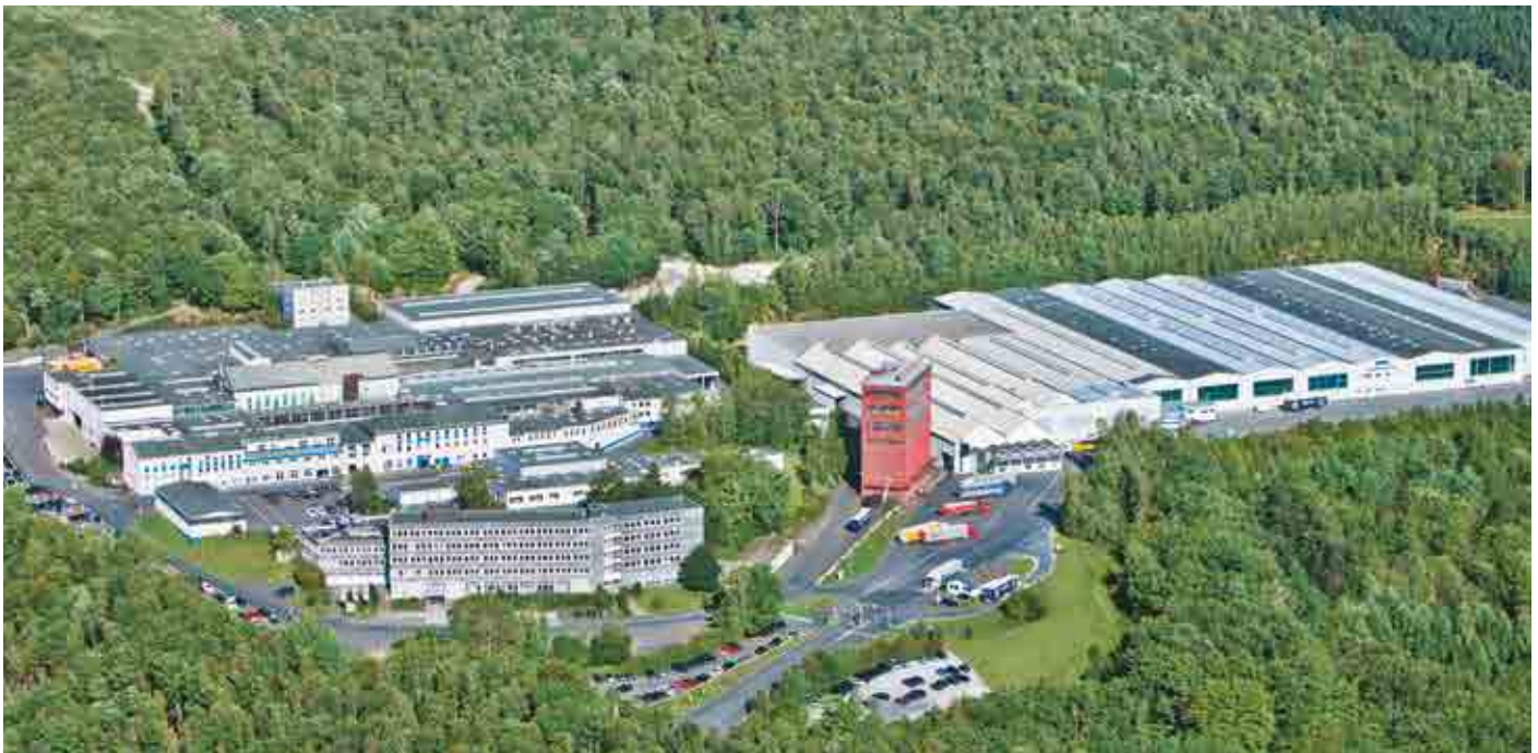
Head office and production site at Neunkirchen (D)